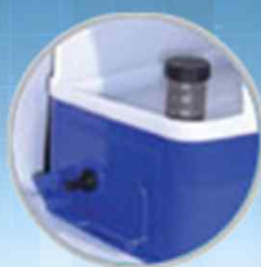
Inside filtering net for preventing clogging