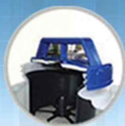
Packing for preventing leak