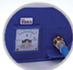
External Voltage Display