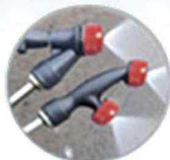
Strong spraying power